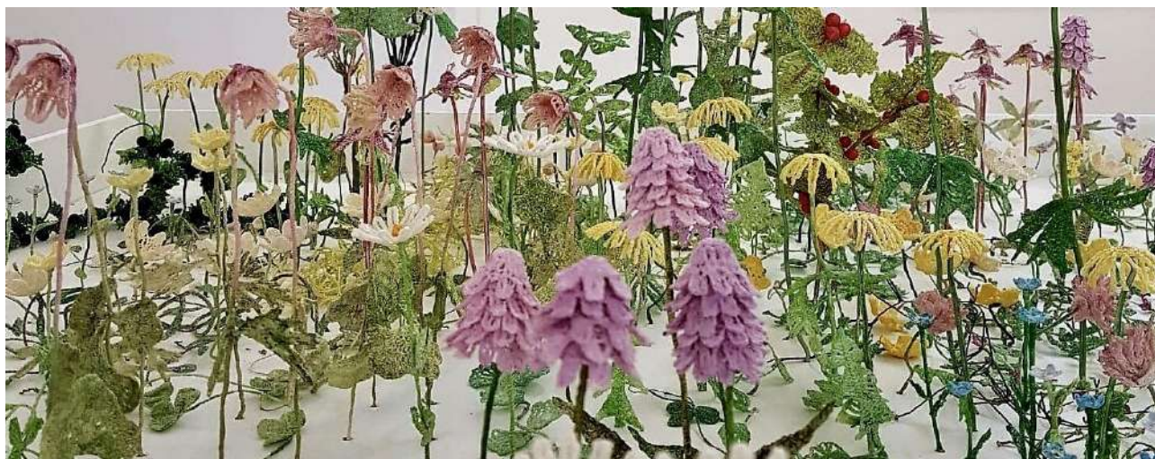
HEKLAR LÆKNINGAJURTIR - RÓSA SIGRÚN JÓNSDÓTTIR

The meeting was held in northern Iceland at Leifshús in Eyjafjörður and in Blöndós. The theme of the conference was materials and methods. The artistic idea is to illuminate themes from different aspects through lectures, workshops, exhibitions, and educational visits. Read the full report on our website.