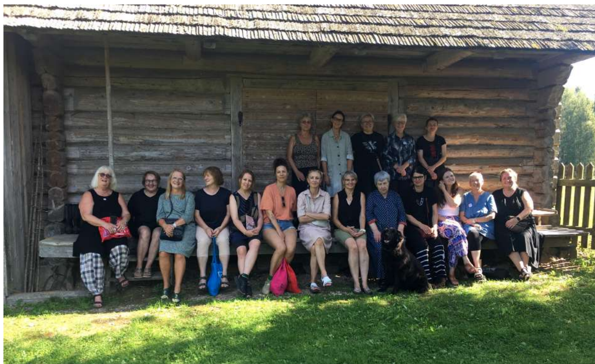
NTA + EteKL + TEXO + TEXTILE ARTISTS LITHUANIA, IN ESTONIA 2023. TEXTILE TALK/TALK TEXTILE

Long term Network funding, Nordic Culture Point, 17/5 - 2022 - 31/12 2024