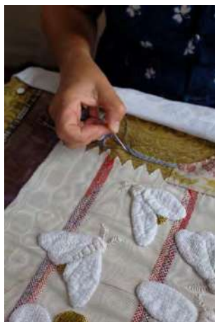
TABEA DÜRR, TALKING HANDS.