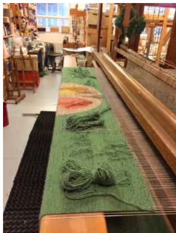
VÆVEVÆRKSTEDET | SMALLEGADE52.