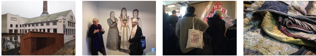
NORDIC TEXTILE MEETING IN BERGEN 30.3 - 3.4 2016 - THE VALUE OF TEXTILE ART/ADDED VALUES

The Nordic cooperation and the Nordic textile art are the foundation of NTA. Nordic Textile Art wants to create forums for discussions about contemporary textile art. In order to widen the network in the different countries it is important that on site at the Nordic artists have the discussions and connect to already established networks. The annual meetings are therefore held circulating in the Nordic countries and at the same time a Nordic Textile conference with themed inspirational days.