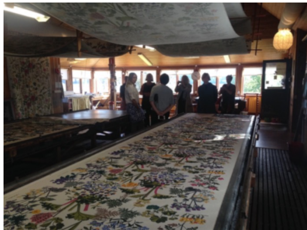
TEXTILE TALK/TALK TEXTILE, NETWORKING AND WORKSHOP NTA AND TEXO IN RÄTTVIK. VISIT JOBS HANDTRYCK